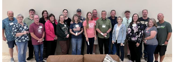
This picture was taken the last night of class when several were unable to attend.

We also learned that we are created to accomplish all that God has prepared in advance for us to do.